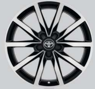
18" machined-face black alloy wheels Optional on Excel grade