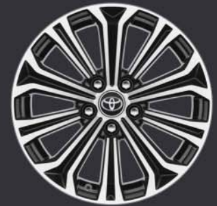
17" machined-face alloy wheels Standard on Excel 1.8 Touring Sport