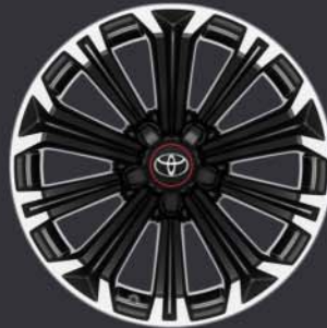
17" machined-face alloy wheels Standard on GR SPORT Touring Sport 1.8