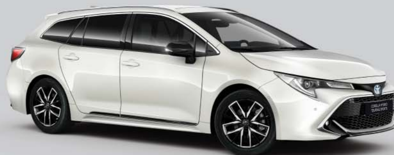
Black front bumper trim and black lower door trim

Colour-matching red and black wing mirror covers are not part of the Style Pack, however they can be purchased separately.