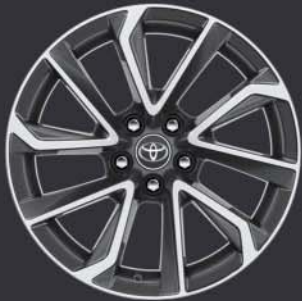
18" machined-face alloy wheels Standard on Excel Hatchback and 2.0 Touring Sport