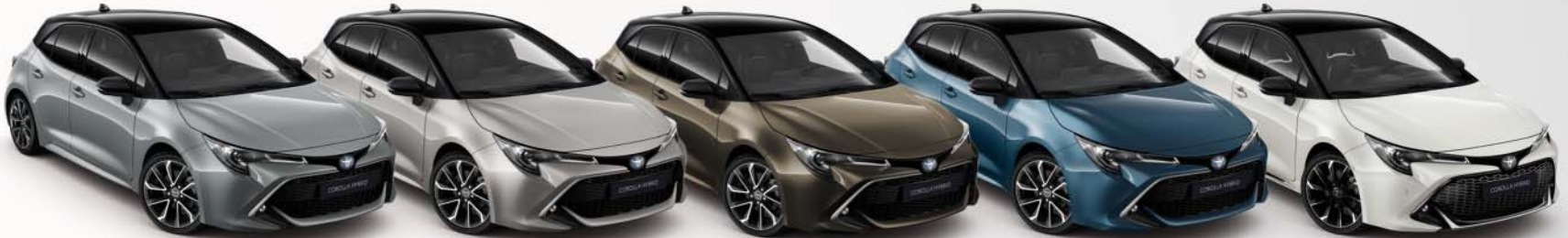
2QS Manhattan Grey* / Eclipse Black