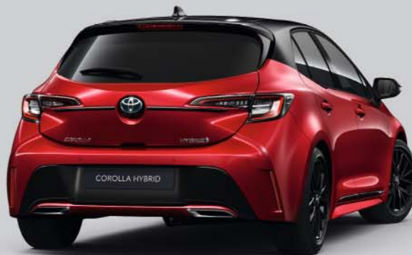
Black lower door trim and tailgate trim