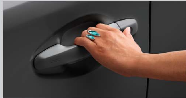
Door handle protection film

Available on all grades for all body types.