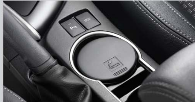
Removable console storage can

Available on all grades for all body types.