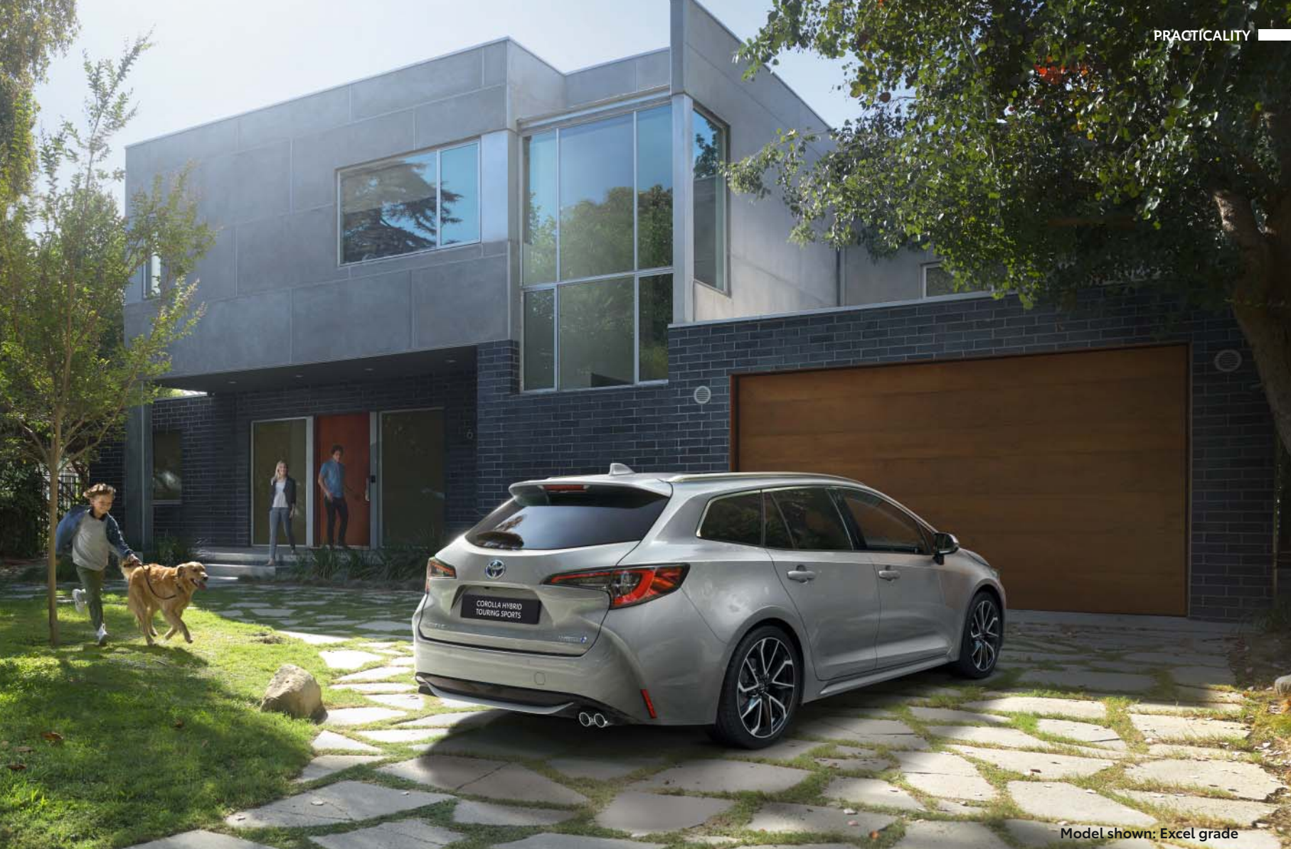
Model shown: Excel grade