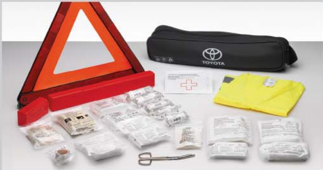
European safety kit

Available on all grades for all body types.