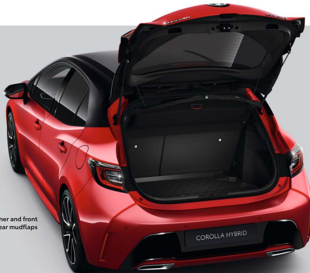
Boot liner and front and rear mudflaps

* Essential Protection Pack on GR Sport Hatchback & Trek graded do not come with mud-flaps due to incompatibilities. Essential Protection Pack is currently not available GR Sport Touring Sport.