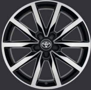
18" machined-face alloy wheels Standard on TREK Special Edition

Make your Corolla stand out from the crowd even more by enhancing its exterior look further using these sets of alloy wheels. Alloy wheel options are available for Hatchback and Touring Sports only.