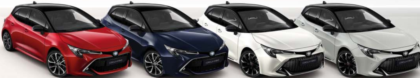
2SZ Scarlet Flare S / Eclipse Black