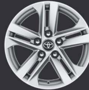
16" alloy wheels Standard on Icon and Icon Tech Hatchback and Touring Sport