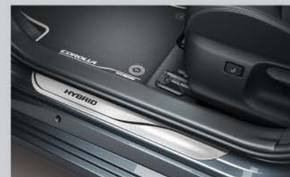
Aluminium scuff plates