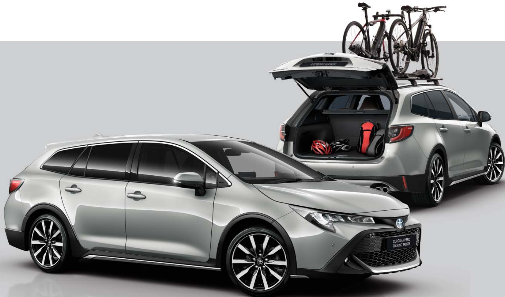
Model shown is Corolla TREK Special Edition.