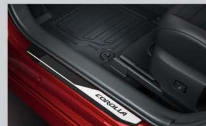
Rubber floor mats and aluminium scuff plates