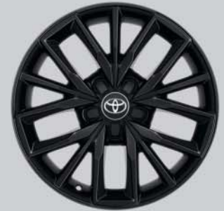
17" gloss black alloy wheels Optional on Design grade