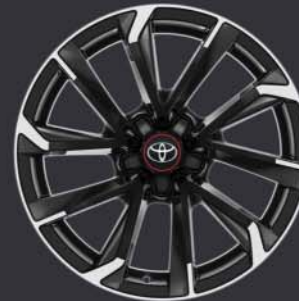
18" machined-face alloy wheels Standard on GR SPORT Hatchback and Touring Sport 2.0