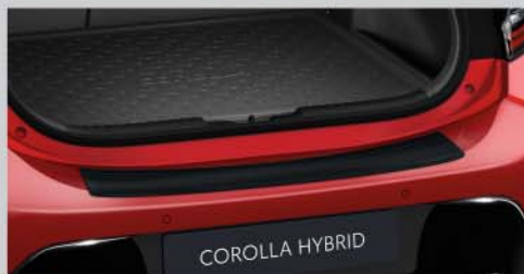
Rear bumper protection plate