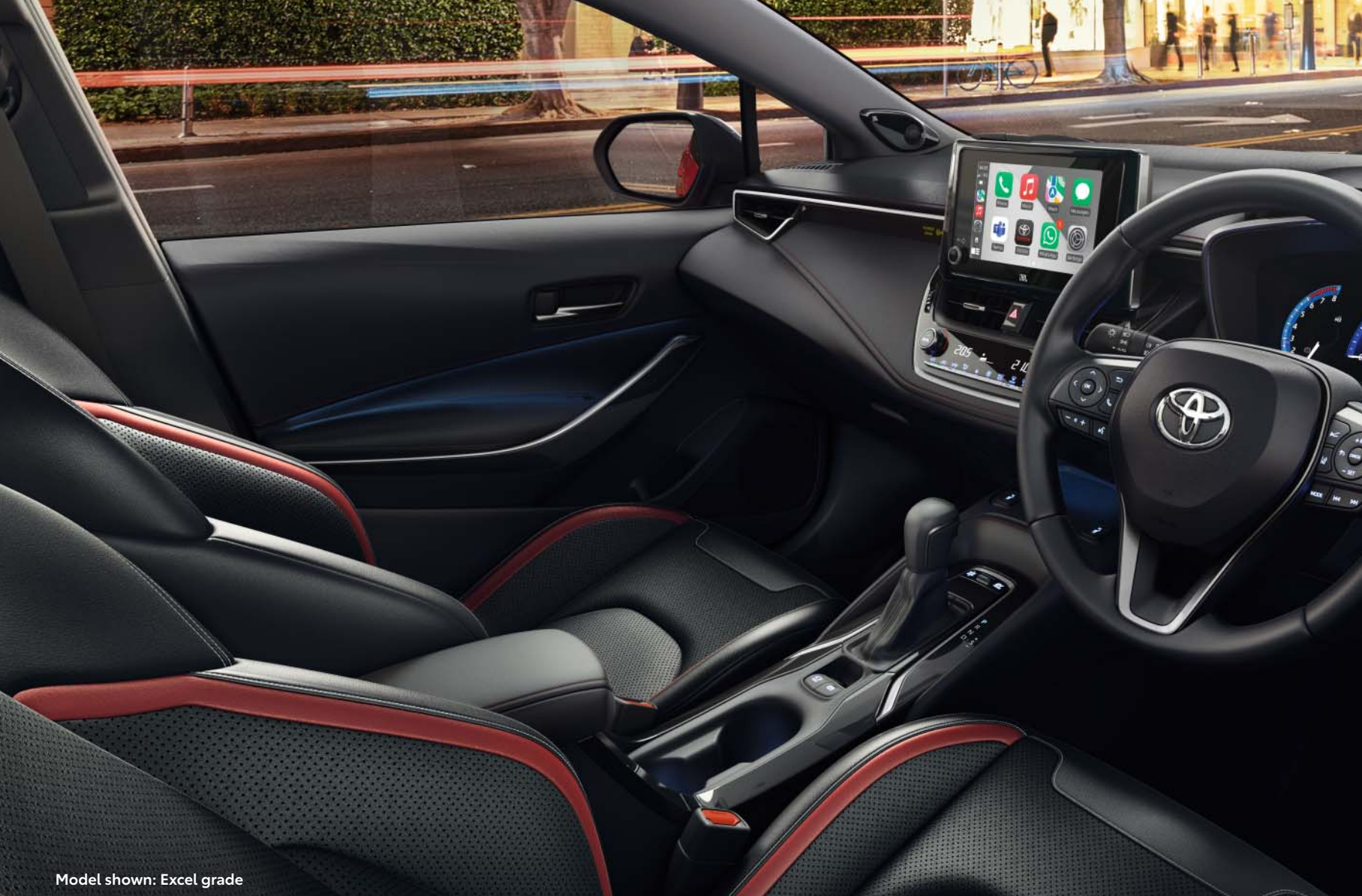
Model shown: Excel grade