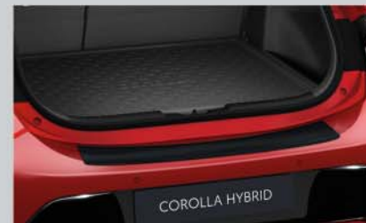
Rear bumper protection plate (black plastic)

Applicable to all grades for both Hatchback and Touring Sports body type, not available for Corolla TREK and GR SPORT.