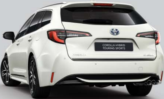
Black lower door trim and tailgate trim