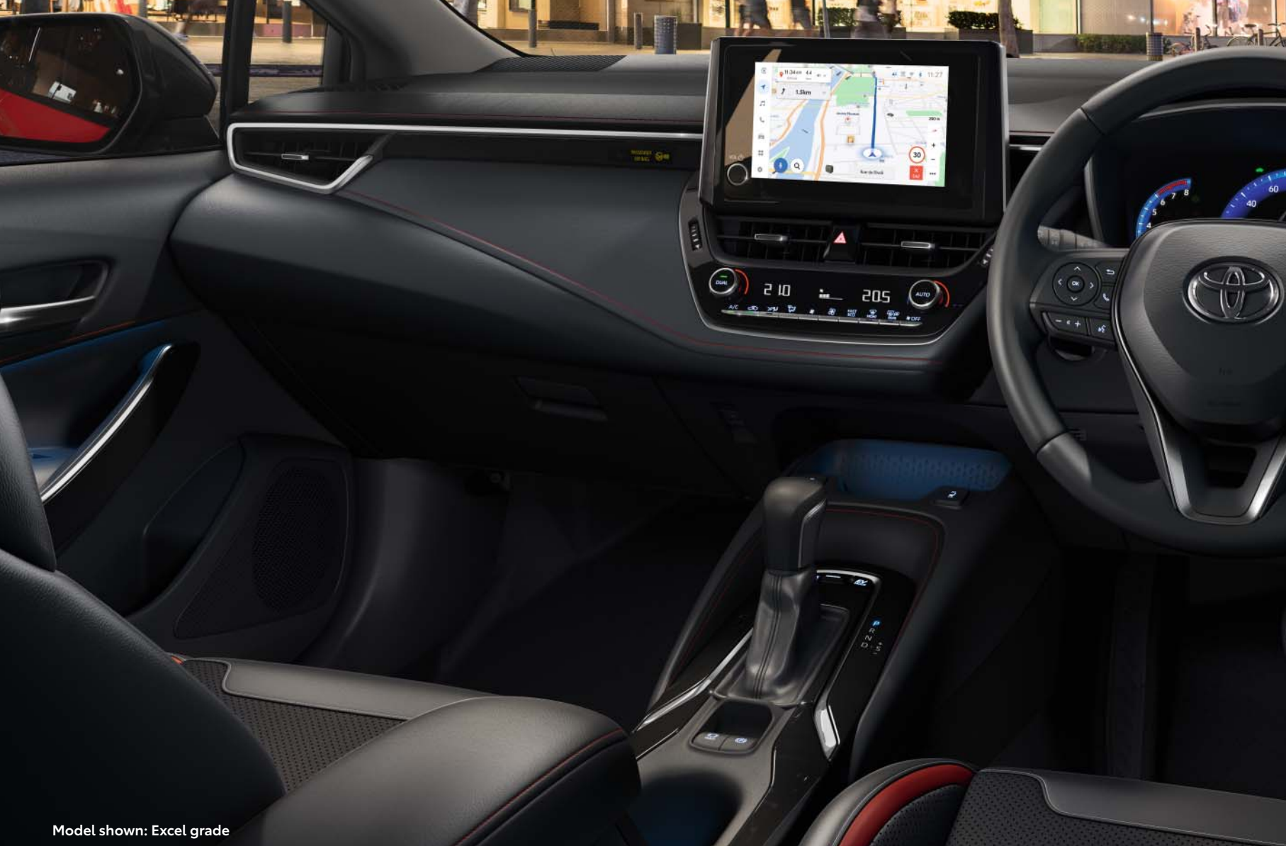
Model shown: Excel grade