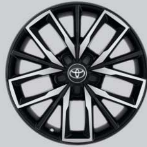
17" machined-face black alloy wheels Optional on Design grade