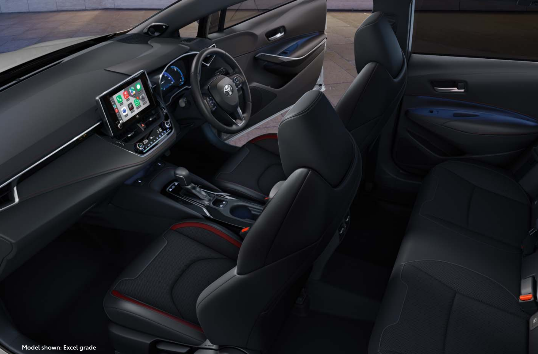
Model shown: Excel grade