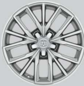
17" silver alloy wheels Optional on Design grade