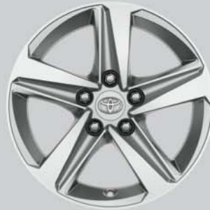
16" silver alloy wheels Optional on Icon and Icon Tech grade