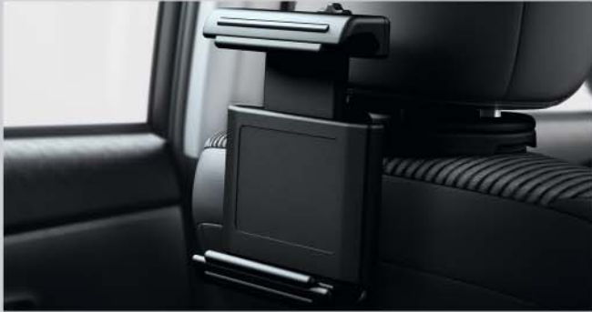
Universal tablet holder with docking station

Available on all grades for all body types.