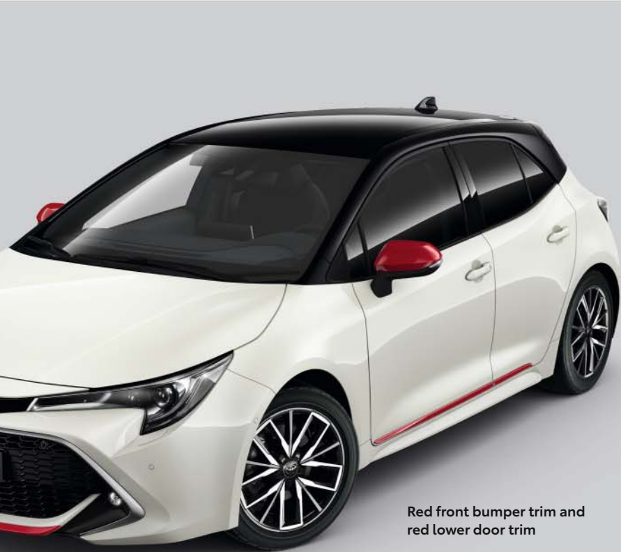
Red front bumper trim and red lower door trim