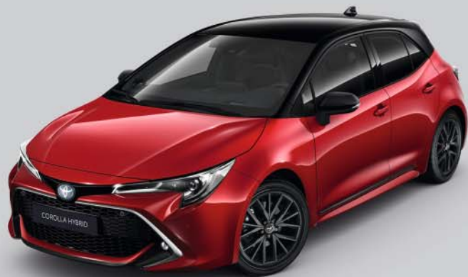
Black front bumper trim and black lower door trim