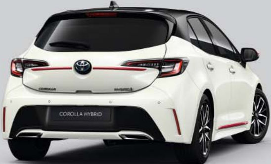
Red lower door trim and tailgate trim