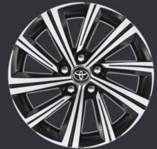
17" machined-face alloy wheels Standard on Design Hatchback and Touring Sport